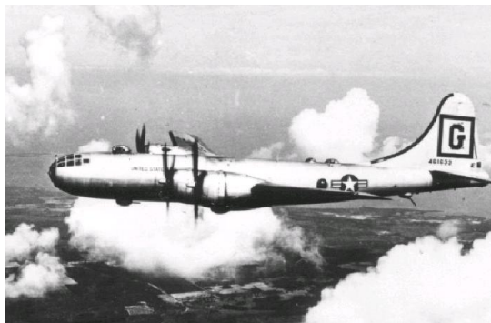
A 305 BW B-29, 1951—Still using the G they had used in WW II, but this time the square designation of the 2nd Air Force.

After World War II, the newly independent Air Force used the wing structure as its most basic organizational establishment, but operational wings of today grew from their antecedent groups—in most cases keeping the original unit emblem, and receiving the bestowed heritage of its predecessor establishment. For the 305th, the activation of a new wing-based establishment took almost five-years. At the behest of Gen Curtis LeMay, and in recognition of the group's fine war record, the 305th Bombardment Wing activated on 2 January 1951 at MacDill AFB, Florida. As with the World War II unit, the 364th, 365th and 366th Bomb Squadrons, formed the combat elements of the new wing. This activation was part of a major increase in the Strategic Air Command (SAC) in response to both the Korean War and the growing Cold War with the Soviet Union and Communist China. The wing was initially equipped as a B-29 unit with refurbished WW II aircraft from a storage depot in Arizona. Staffed by a small core of active duty personnel coming from other SAC and Air Force units, most personnel were Reservists recalled for Korean War service, representing the entire range of WW II experience. They were soon joined by some of the first B-29 combat crews to return from the Far East. Col Elliot Vandevanter, a decorated bomber pilot and 385th Bomb Group commander from World War II assumed command.