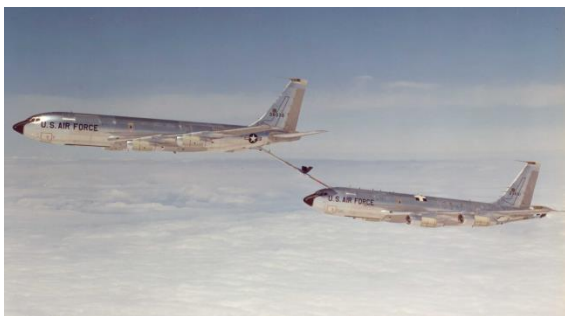
Test of air-refuelable KC-135's at Edwards AFB

On 1 January 1970, the wing was redesignated the 305th Air Refueling Wing (Heavy) and the 70 ARS was transferred from Little Rock AFB with total KC-135 aircraft authorized jumping to 30. This would later rise as high as 40 planes and numbers varied over the years with periodic organizational changes. The wing also assumed the Post Attack Command and Control System (PACCS) mission as an alternate to the LOOKING GLASS airborne command post at Offutt AFB, NE. The 3 rd Airborne Command and Control Squadron (3 ACCS) was activated at Grissom AFB on 1 April 1970 and, on 9 November 1970, they launched their first scheduled LOOKING GLASS mission in place of the normal Offutt AFB crew. The first unscheduled alert relief mission was launched on 10 December due to bad weather at Offutt AFB, validating their alert and emergency operational capabilities. They periodically flew scheduled and unscheduled missions thereafter. The 3 ACCS became part of an Air Force historical first on 5 April 1975 when Lt Col John B. Spence assumed command; the first navigator to command a tactical flying unit in SAC. This was short lived however as 3 ACCS was inactivated that 31 December and its aircraft, crews and mission absorbed into the 70 ARS. As a refueling wing, the 305 ARW became a workhorse on behalf of the rest of the Air Force. They were regularly tasked to support SAC’s B-52 wings in exercises and ORI’s, along with overseas alert taskings.