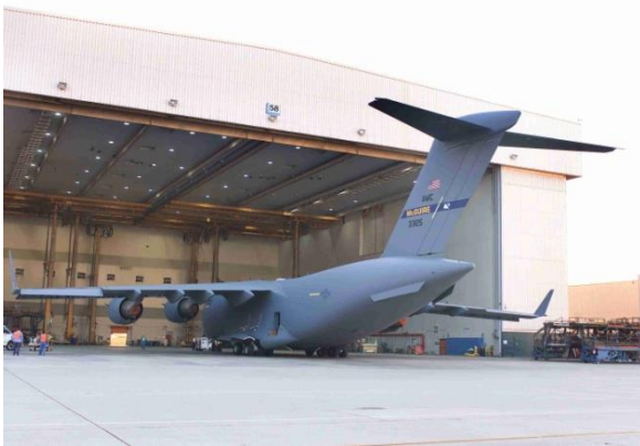
Roll out of “The Spirit of New Jersey” 2004. The first dedicated C-17 at McGuire.

Another aircraft change was in the works for the Wing in the early years of the new century. With a high operations tempo and a C-141B phase-out in progress that eventually inactivated two squadrons--the 18 AS and the 13 AS in 1995 and 2001 respectively--all in anticipation of the phase-out of the C-141B in September 2004, McGuire began building more than $80B in C-17 support facilities in 2002. In September, 2004, the 305 AMW had the honor of being the last active duty C-141B wing. In its place, the C-17A Globemaster III took over the wing's primary airlift mission.