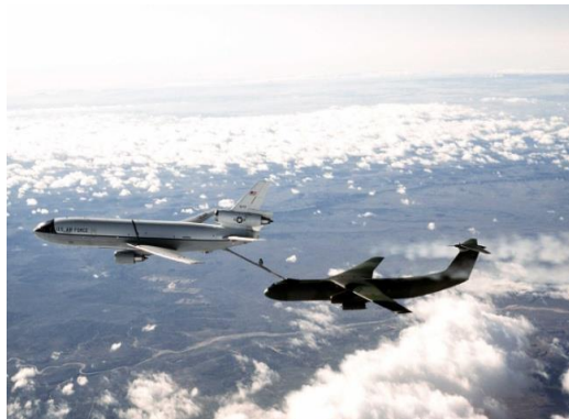
First 305 AMW Joint refueling training mission, October 1994. The wing inherited a mixed bag of “white top” KC-10s, Euro I C-141Bs, and a fleet standard AMC gray for both planes.

Based on a USAF Chief of Staff directed review of unit lineage and honors, the 305 AREFW was selected for retention in the active force even as the USAF downsizing was in progress due to its bestowed World War II heritage and peerless readiness in the Cold War. In a 28 February 1994 announcement, the 305th Air Refueling Wing was designated for transfer (without personnel or equipment) to McGuire AFB, New Jersey on 1 October 1994. Because the KC-10 mission was moving to McGuire as well, it was also redesignated as the 305th Air Mobility Wing, taking over the personnel and equipment of the inactivated 438th Airlift Wing and flying the C-141B Starlifter and KC-10 Extender.