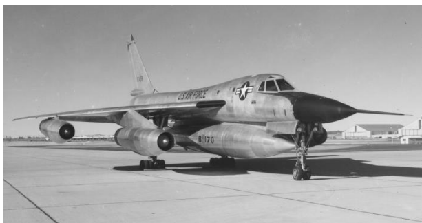
Convair B-58A “Hustler.” A truly powerful and fast bomber—capable of Mach 2+ speeds, The 305 BW was one of only operational two wings equipped with it.

The 305 BW was in fact undergoing a double conversion as the bomb squadrons were preparing to receive Convair’s B-58 Hustler, USAF’s first supersonic bomber.